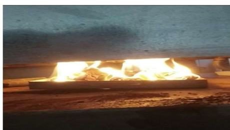
Burning of waste papers and bagasse.