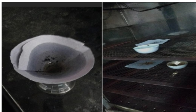
Performing of TSS Test

This test is performed to experimentally prove that PCT can actually trap Particulate matter.