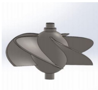
Figure 2: Blade Front View

OUTLET VANE ANGLE ( \alpha2 ):- = 30.96^{\circ}