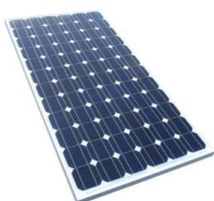
Fig..3. Solar Panel

Solar panels use the energy from the sun to generate heat or electricity. A bundled, connected assembly of typically 6x10 photovoltaic solar cells is known as a photovoltaic (PV) module. The photovoltaic array of a photovoltaic system, which produces and supplies solar electricity for commercial and residential uses, is made up of photovoltaic modules.