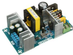
Fig..6. Inverter Module

With the use of the proper transformers, switching, and control circuits, an inverter is an electrical device that transforms direct current (DC) into alternating current (AC). The converted AC can be produced at any desired voltage and frequency.