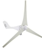
Fig..4. wind turbine

A renewable energy source is wind. The kinetic energy of the wind is transformed into electric energy by a wind turbine. The blades' shaft-connected generator transforms mechanical energy into electrical energy. Depending on the axis on which the blades rotate, there are two different types of wind turbines.