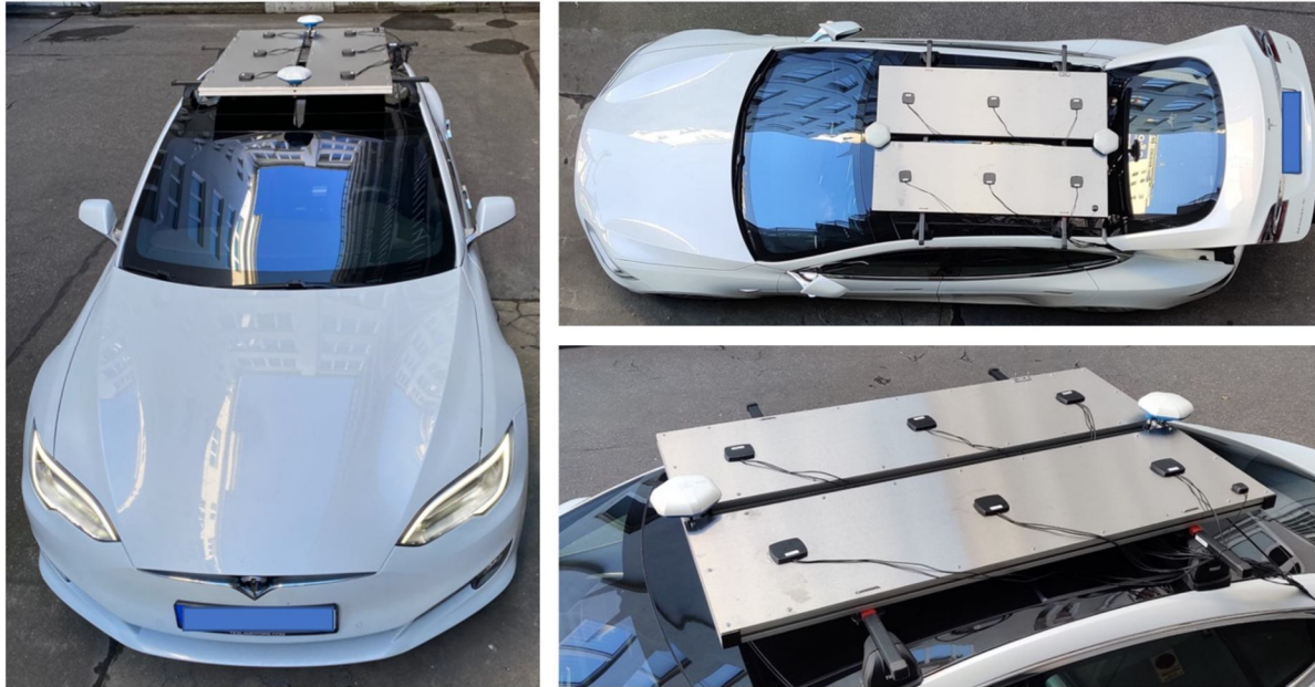
Figure 1. The antenna setup of the vehicle.

IoT sensors installed along highways can continuously monitor traffic conditions, including vehicle speed, density, and flow patterns [9-11]. This data is transmitted to central control systems where it is analyzed to detect congestion, accidents, or other anomalies. Based on this information, traffic management centers can implement dynamic traffic control measures such as adjusting speed limits, changing traffic signal timings, and providing real-time traffic updates to drivers via electronic signage or mobile applications shown in Figure 1 [12]. This helps to reduce congestion, improve traffic flow, and enhance overall road safety.