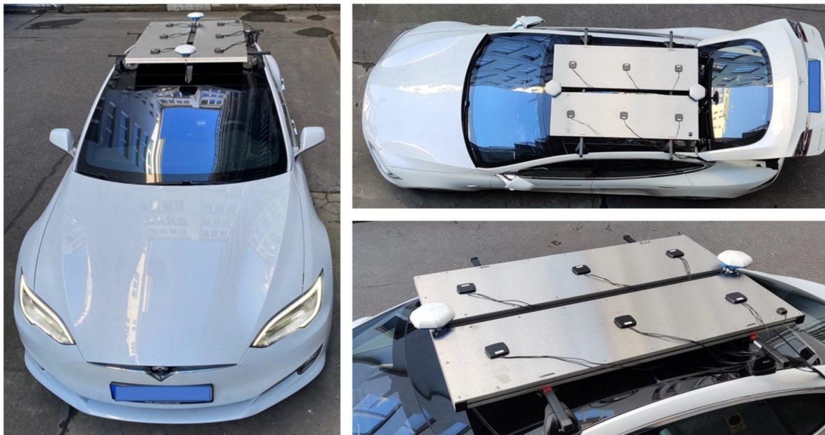
Figure 1. The antenna setup of the vehicle.

IoT sensors installed along highways can continuously monitor traffic conditions, including vehicle speed, density, and flow patterns [9-11]. This data is transmitted to central control systems where it is analyzed to detect congestion, accidents, or other anomalies. Based on this information, traffic management centers can implement dynamic traffic control measures such as adjusting speed limits, changing traffic signal timings, and providing real-time traffic updates to drivers via electronic signage or mobile applications shown in Figure 1 [12]. This helps to reduce congestion, improve traffic flow, and enhance overall road safety.