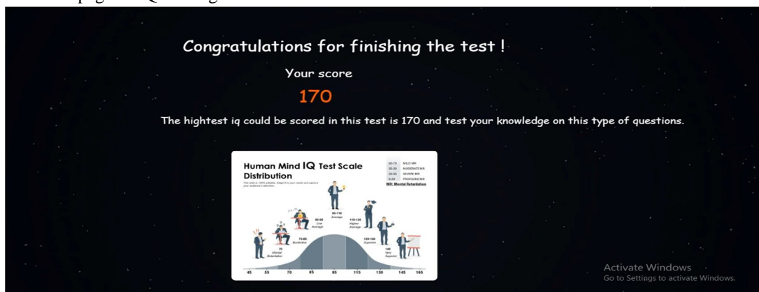
Fig 4.2: Result page of IQ Testing

Fig.4.1 shows the home page of IQ Testing