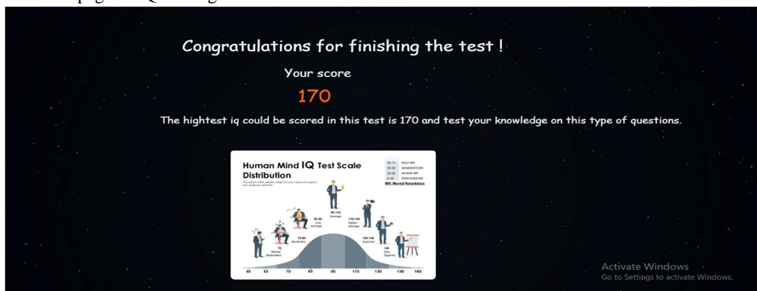
Fig 4.2: Result page of IQ Testing

Fig.4.1 shows the home page of IQ Testing