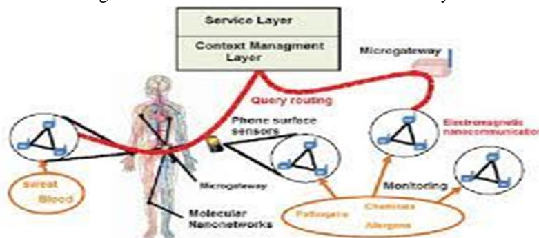
Fig. 2. The Internet of Nano-Things

When it comes to cattle, IoT can assist in identifying animals that graze in open locations, detecting detrimental gases from animal excrements in farms, as well as controlling growth conditions in offspring to enhance chances of health and survival and so on. Moreover, through IoT application in agriculture, a lot of wastage and spoilage can be avoided through proper monitoring techniques and management of the entire agriculture field. It also leads to better electricity and water control.