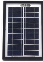
Fig: Solar Panel

A total of 3W of solar panels were installed in this installation. The apparatus depicted in the diagram is used to generate the needed output for measurement. These feature a 3W maximum power output, a 5.5 V maximum voltage, and a 370mA maximum current.