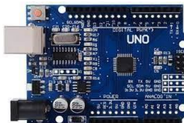
Fig: Arduino UNO Microcontroller

Because of its simplicity and ease of configuration, Arduino is a popular open-source prototyping platform in the digital world. The Arduino UNO R3 utilized in the project is a microcontroller board based on the AT Mega 328 with a 16Mhz crystal, 6 analog inputs, and a USB connector that serves as a power supply and communication route.