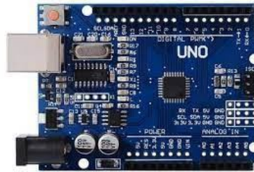
Fig: Arduino UNO Microcontroller

Because of its simplicity and ease of configuration, Arduino is a popular open-source prototyping platform in the digital world. The Arduino UNO R3 utilized in the project is a microcontroller board based on the AT Mega 328 with a 16Mhz crystal, 6 analog inputs, and a USB connector that serves as a power supply and communication route.