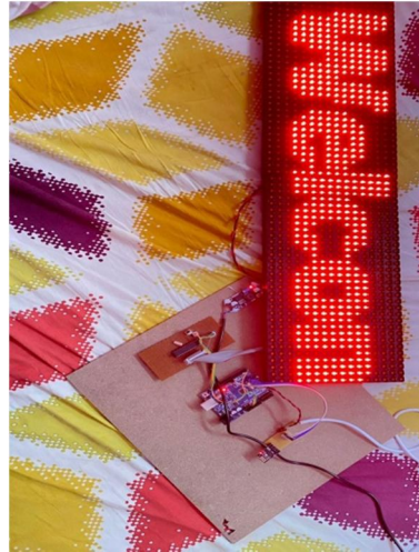
Fig: Circuit and connections