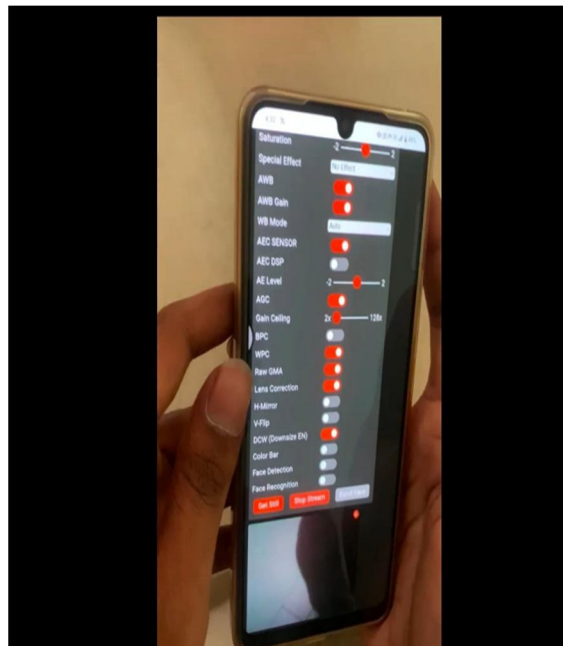
Fig 3: Final Output