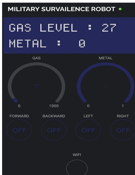
Fig 4: Output in Blynk app