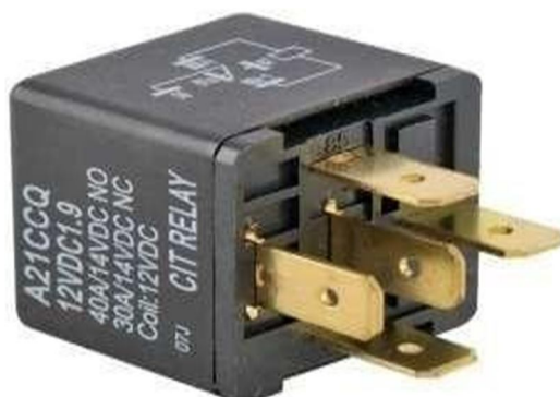
Figure 3.3 Relay

Relays are electromechanical switches commonly used in electronic circuits to control high-power devices using low-power signals. They consist of a coil and one or more contacts, which open or close in response to changes in the coil's energization status. Relays offer isolation between control and load circuits, making them essential components for applications requiring electrical isolation or switching of high-voltage/current load.