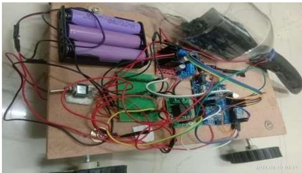
Figure 4.1 Side view of system

The implementation of the IoT-based remote-controlled smart helping agent for household cleaning has yielded promising results. Through rigorous hardware design and software implementation, the system effectively performs mopping and vacuum cleaning tasks across various floor surfaces. Advanced sensors and intelligent algorithms enable the agent to navigate obstacles and adapt to different environments autonomously, optimizing cleaning efficiency and coverage. Moreover, the user-friendly Android application allows for convenient remote operation and tracking of cleaning operations, eradicating the necessity for operation and enhancing user satisfaction