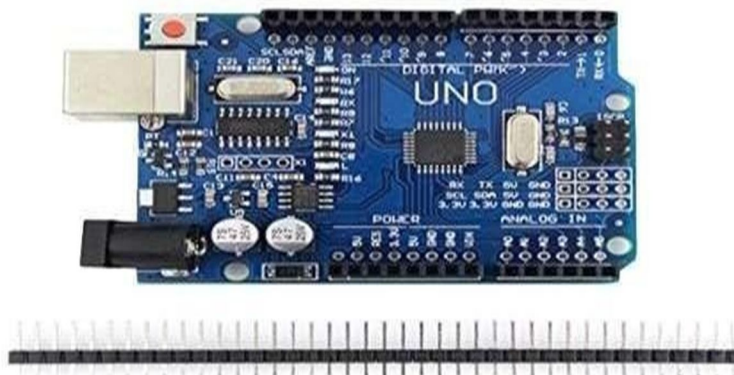
Figure 3.2 Arduino-uno