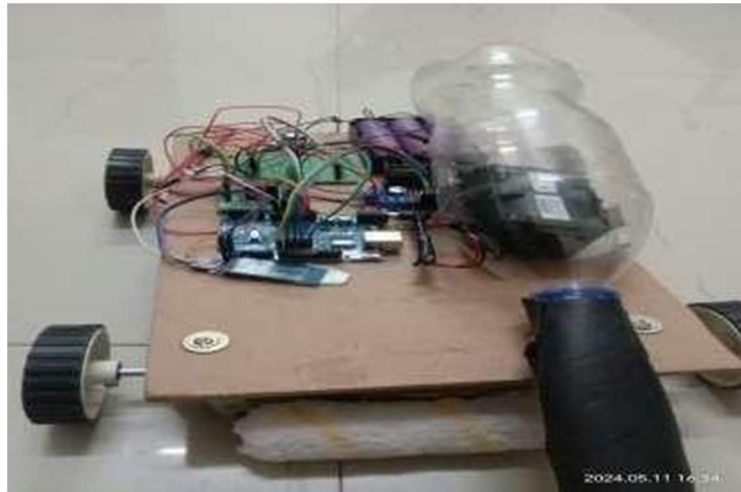
Figure 4.2 Front view of system