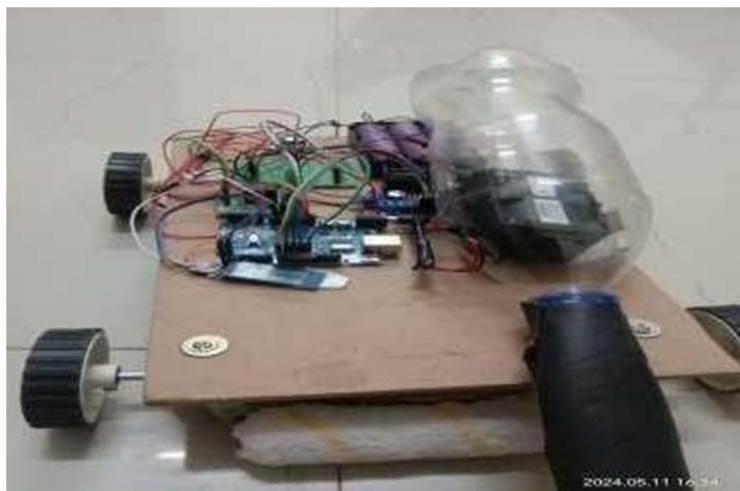
Figure 4.2 Front view of system