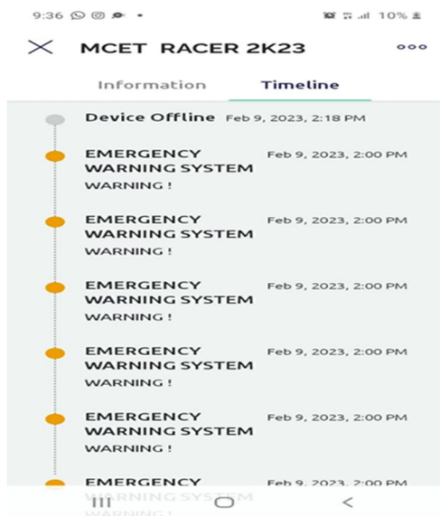
Fig.2 Test run attempts