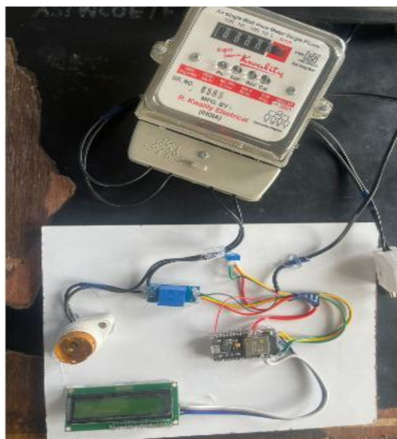
Fig 3. Hardware Assembly