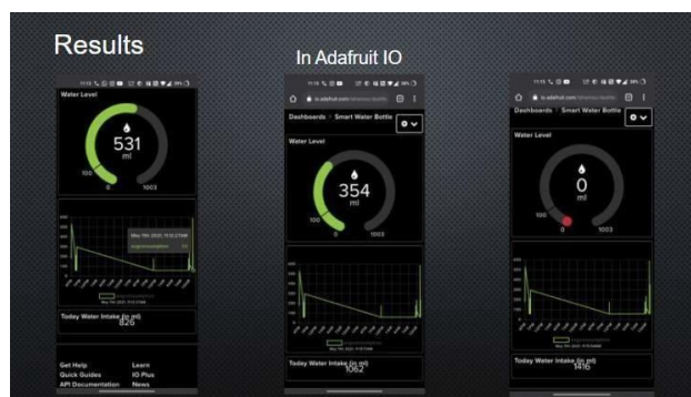
Fig 4.3 Adafruit IO Dashboard

The leakproof ultrasonic detector is installed into the bottle cap using cement gun. By fixing the cap to the bottle the entire setup of design is done. The bottle will start reading the water position inside it using the ultrasonic detector. The values are manipulated by the program which is ditched in the Nodemcu and the needed data is projected on periodical examiner in Arduino IDE. The needed labors of the design are reflected in the Adafruit IO feeds.