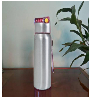
Fig.1.1 Prototype of a Smart Water Bottle.

Water is the source of life, and it's necessary for the correct functioning of mortal organs to drink enough water on a regular base. Humans, on the other hand, have excited schedules and are constantly distracted, making it delicate to flash back to drink enough water. In a study of professionals and university scholars under the age of 50, further than 70 said they forgot or may forget to drink water owing to their agitated schedule. So, to develop a good water drinking habits, we must keep track of our water consumption on a quotidian base. The IoT- predicated Smart Water Bottle will be fairly useful in this regard. The design's major thing is to help the user in maintaining an respectable and controlled water input.