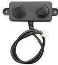
Fig.3.2 Water proof Ultrasonic Sensor

An ultrasonic distance detector measures the time between transferring and entering an ultrasonic palpitation to determine the distance to a target. ME007YS is a leakproof ultrasonic detector module with a range of 4.5 meters. It works with 5V bias like Arduino, Raspberry Pi, and others. Because the typical current of the ME007YS is just 8mA, it may be powered via the IO harborage of utmost regulators. The ultrasonic detector uses a unrestricted transmitter and receiver inquiry that's leakproof and dustproof, making it ideal for harsh and wettish measuring surroundings. It has a 2.54- 4P interface and communicates through UART. ME007YS has experienced expansive testing and optimization, allowing it to give a quick response time, high stability and perceptivity, and low power consumption.