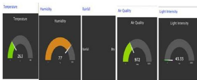
Fig. 2: Dashboard with various parameters

The below diagram displays the dashboard with various parameters which are monitored.