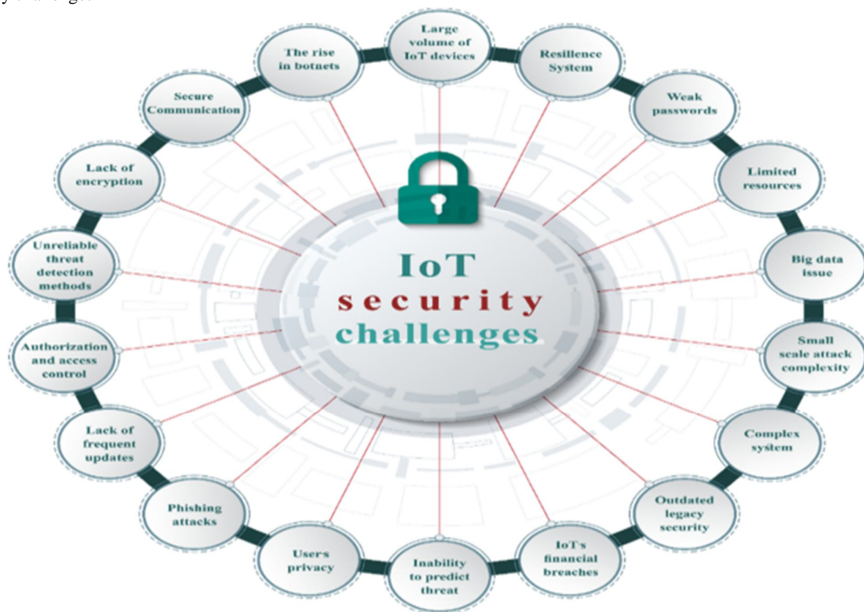
Security Problems in IoT