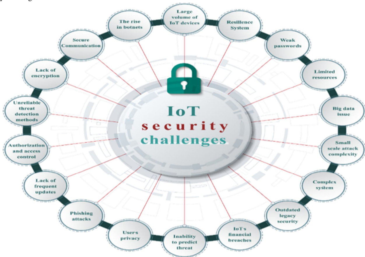
Security Problems in IoT