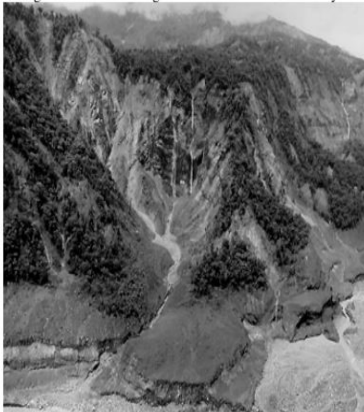
Aerial view of the northeast valley wall of the Malo River, northeast Ecuador, showing extreme denudation of slopes due to slips/avalanches/flows triggered by the 1987 Reventador earthquakes.

The destruction of temperate forests by landslides has also been studied extensively. In their study of the influence of landslides on forest vegetation in the Valdivian Andes due to the 1960 M=9.2 Chilean earthquake, Veblen and Ashton (1978, p. 165) have noted that: "Catastrophic mass movements associated with seismic activity have affected the Andes of south-central Chile several times in the past 400 years and have profoundly influenced the regional vegetation." They further noted that more than 250 km 2 of temperate forest slopes were denuded in the 1960 event.