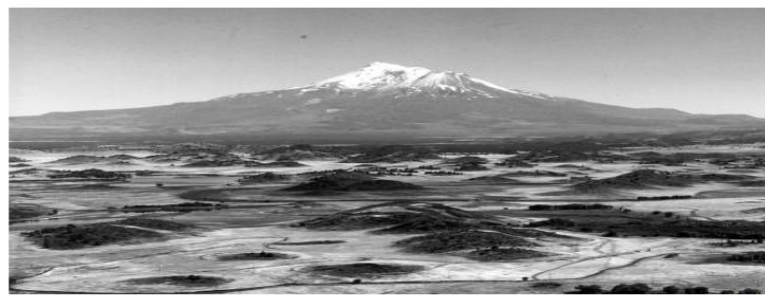
Fig. 5. Aerial oblique view to the south of the ancestral Mount Shasta, California, debris avalanche (foreground and middle distance).