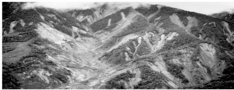
Fig. 4. Destruction of vegetative cover on the valley walls of the upper San Vicente River, southwestern Colombia, by slides, debris avalanches, and debris flows triggered by the 1994 Paéz earthquake.