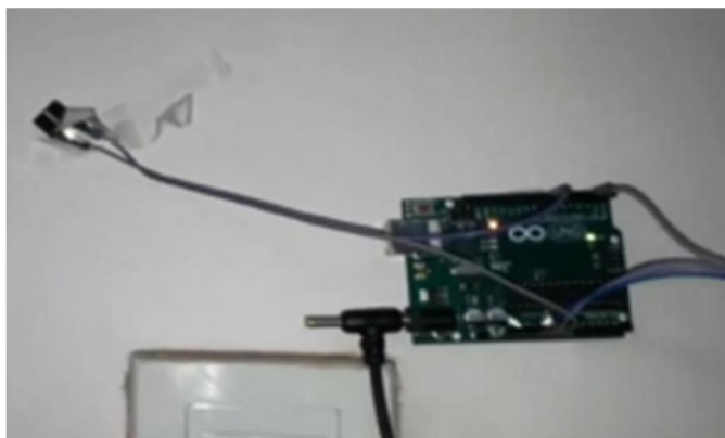
Figure.3. The setup of the main circuit

Simply the emitter emits the laser line and the LDR receives the bright striking laser light.