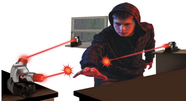
Figure .4. The laser ray is discontinued by the intruder.

As per his/her convenience the laser line can be extended with the help of small mirror pieces, as mirror perfectly reflects laser lines. Like this the entire area of a door or a window or specific stealthy entry points can be covered with multiple reflecting laser lines emitted from a single source.