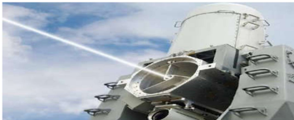
Figure 2: MIRACL

The United States Navy developed the Mid-Infrared Advanced Chemical Laser (MIRACL) in 1980 as a kind of Directed Energy weaponry. Over a megawatt output is produced for up to 70 seconds using Deuterium Fluoride as the chemical media. Developed to locate and destroy anti-ship cruise missiles, MIRACL underwent testing in California at a contractor site and afterwards in New Mexico at the white sands missile range. The echoed beam was 21cm in height and 3cm in width, and it was put to the test at a distance of 432km from MSIT-3, a decommissioned US Air Force satellite. Unfortunately, MIRACL failed the test and was destroyed in the process. During the trial, a second, weaker laser was able to briefly blind the MSIT-3 detectors. (Vishwakarma, 2017)