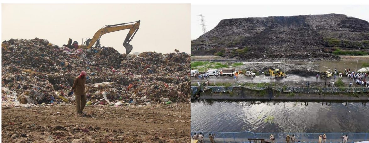
Fig: - 2 Nearby Area of Ghazipur landfill Site, New Delhi

In Table No.1 the list of different instruments used to identify different parameters of leachate are shown below.