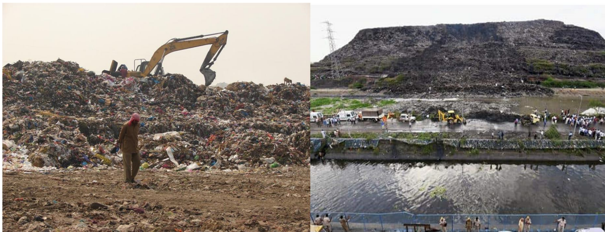
Fig: - 2 Nearby Area of Ghazipur landfill Site, New Delhi

In Table No.1 the list of different instruments used to identify different parameters of leachate are shown below.