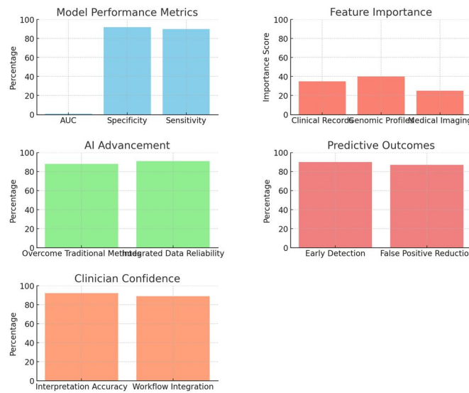
Clinical AI Metrics and Insights

This chart presents key metrics related to clinical artificial intelligence, including model performance, feature importance, advancements in AI, predictive outcomes, and clinician confidence. Each subplot effectively conveys performance percentages or importance scores, allowing for a comprehensive overview of the AI's impact in a clinical setting. The design ensures clarity and ease of reading for the audience.