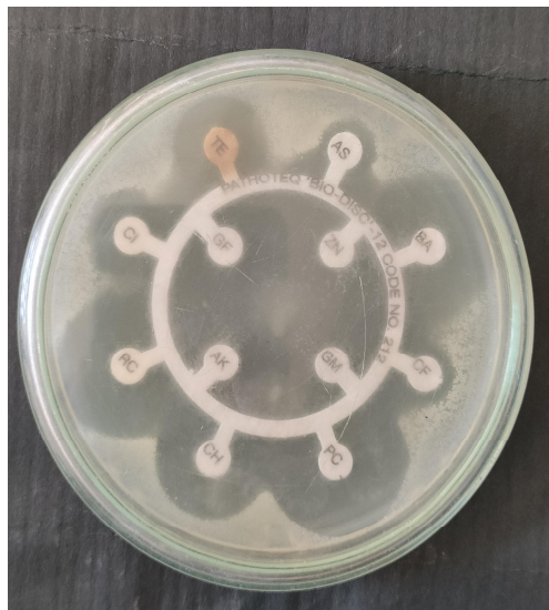
Figure 1 Antibiogram Susceptibility test