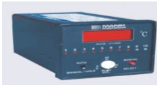
Fig (b) . Thermocouple