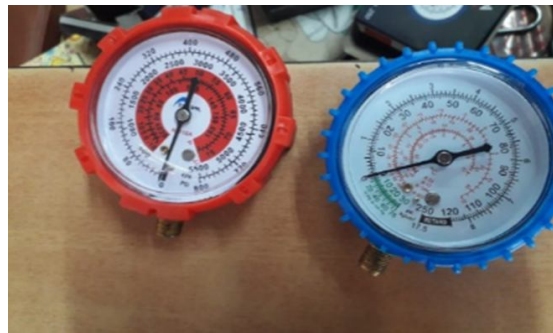
Fig. (c) Pressure & Vacuum Gauge

The devices that are used for measuring pressure are called pressure gauges. Gauge pressure is the pressure relative to atmospheric pressure. For the pressures above atmospheric pressure, gauge pressure is positive. For the pressures below atmospheric pressure, gauge pressure is negative. The pressure gauge is also known as pressure meters or vacuum gauges. Most gauges calculate the pressure relative to atmospheric pressure as the zero point. Hence, this form of reading is known as gauge pressure. Pressure gauges are analog as well as digital.