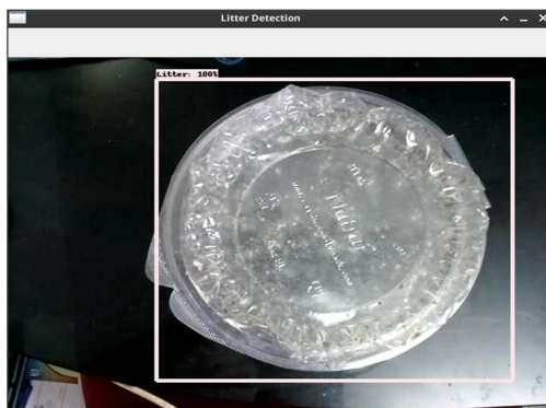
Fig. 1 Model detecting litter as litter

We performed the test with litter and non litter images. The model detected litters and classified them as litter (Fig 1). Those items which are not litters, the model didn't recognise them as litter(Fig 2). Thus ensuring the model only detects things which are litters and not the other items.