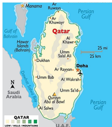
Figure 1: Map of Qatar

The research study was conducted at Philippine School Doha, Qatar. This educational institution was founded on October 3, 1992, and it is the leading basic institution in Qatar. It has been continuously serving overseas Filipino workers and students in Qatar. It also has been producing research-adept learners and giving the best quality of education with the standards of the K-12 curriculum of the home country.