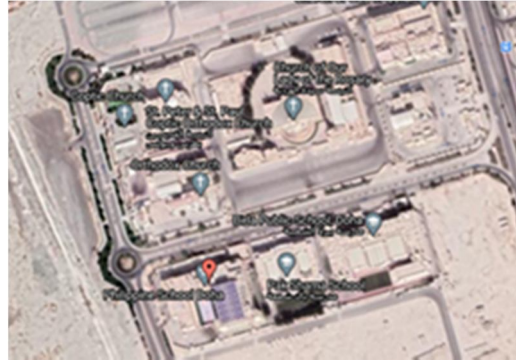
Figure 2: Location of Philippine School Doha (PSD)

The researchers used a criterion to select the eight participants who partook in the study. The following is the criteria used to choose the PSD alumni studying abroad including (1) the participants must be from 1st to 4th-year college students; (2) they should be currently residing in the chosen country for more than five months; (3) they are aged 18 and over; (4) they studied in Philippine School Doha for two or more years; (5) studying in a foreign country excluding Qatar and the Philippines.