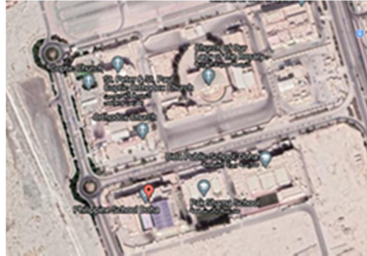
Figure 2: Location of Philippine School Doha (PSD)

The researchers used a criterion to select the eight participants who partook in the study. The following is the criteria used to choose the PSD alumni studying abroad including (1) the participants must be from 1st to 4th-year college students; (2) they should be currently residing in the chosen country for more than five months; (3) they are aged 18 and over; (4) they studied in Philippine School Doha for two or more years; (5) studying in a foreign country excluding Qatar and the Philippines.