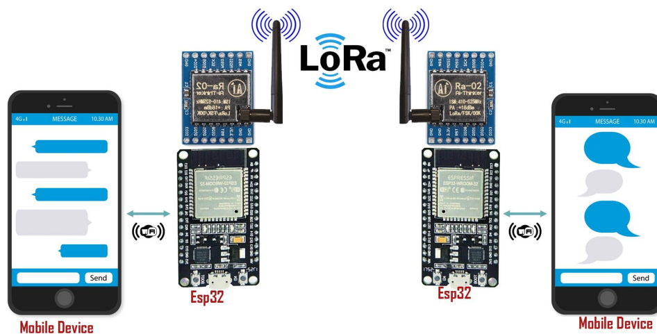
Fig 1.1 Messaging system

The integration of the ESP32 microcontroller and LoRa technology provides a robust communication solution, particularly suited for disaster scenarios where traditional communication infrastructure may be compromised. By implementing efficient messaging protocols and user-friendly interfaces, the system aims to enhance communication resilience and facilitate effective communication during challenging situations.