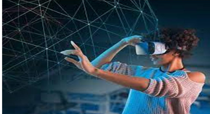
Fig: 3 VR Improves Student's Learning Experience

Virtual reality can improve education by providing students with memorable and immersive experiences that would otherwise not be possible. What's more, it can all take place within the classroom. VR is accessible to every student and can be easily monitored by teachers.