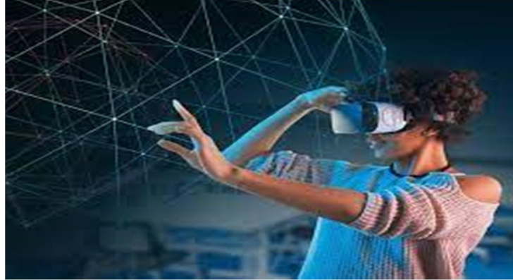
Fig: 3 VR Improves Student's Learning Experience

Virtual reality can improve education by providing students with memorable and immersive experiences that would otherwise not be possible. What's more, it can all take place within the classroom. VR is accessible to every student and can be easily monitored by teachers.