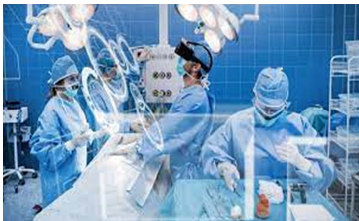
Fig: 2 VR

VR can also be used as a treatment for mental health issues, with Virtual Reality Exposure Therapy thought to be particularly effective in the treatment of PTSD and anxiety.