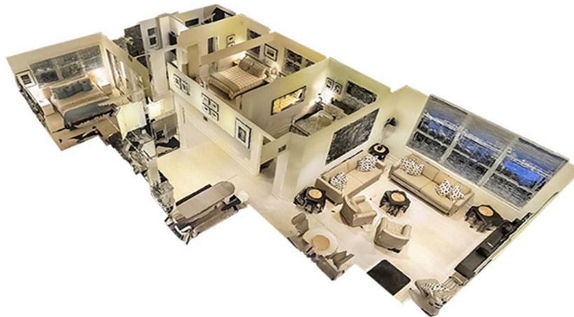
Fig: 6 VR in scanning of building

VR technology has so much potential for architects and designers. From initial design mock-ups, to project collaboration, through to the finishing touches that make a building design go from good to great, virtual reality possesses the capability to really sell an idea better than any other medium.