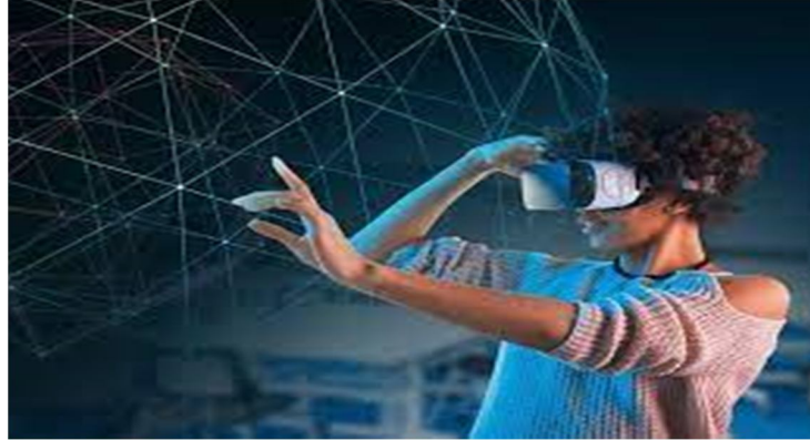
Fig: 3 VR Improves Student's Learning Experience

Virtual reality can improve education by providing students with memorable and immersive experiences that would otherwise not be possible. What's more, it can all take place within the classroom. VR is accessible to every student and can be easily monitored by teachers.