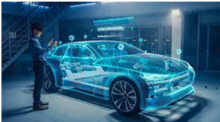
Fig: 1 AR and VR in the Automotive Industry

Car manufacturers are continuously trying to put the current technologies to use in order to deliver the best vehicles. Virtual Reality (VR) and Augmented Reality (AR) technology is advancing rapidly as computers are becoming more powerful. VR in manufacturing industry enables the designers to simulate their design prototype or model on advanced VR software. This helps them to rectify errors at the primary stage and reduce production time and cost.