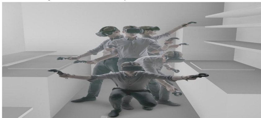
Fig: 7 VR Explores the Virtual representation of room

Floor plans, 3D renderings, and models are often used to convey an idea for a particular space within a design, but even these approaches, a staple of architectural design can fail to effectively communicate ideas with clients.