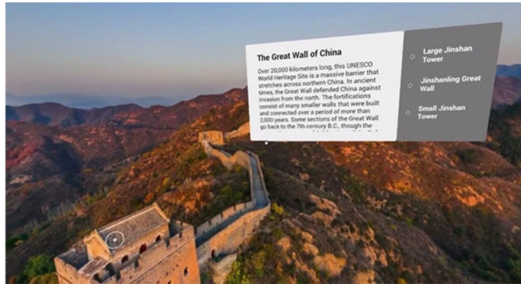
Fig: 5 VR Tourism – The Great Wall of China