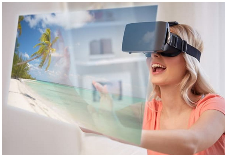
Fig: 4 VR Tourism model

VR can be used in many different ways in the tourism industry. The technology is evolving at a rapid rate and the uses of VR within tourism are expanding along with the technology. The main VR technologies that are used in the travel industry are VR video and VR photography.