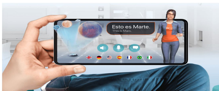
Fig: 9 Mondly AR-based App