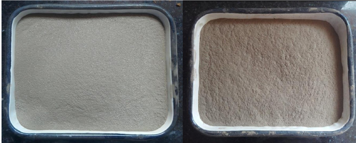
(a) Particle size 75µ-90µ

Glass is a transparent material and it is produced by melting a blend of materials such as silica, CaCO 3 , and soda ash at high temperature followed by cooling during which solidification occurs without crystallization. By manufactured products such as sheet glass, bottles, glassware, and vacuum tubing glass is widely used in our lives. The quantity of waste glass is increased over the recent years due to an ever-growing use of glass products like bottles and sheet glass etc. Mainly glass waste had been dumped into landfill sites. Glasses are not biodegradable so that land filling of waste glasses is undesirable because, which makes them less environment friendly. So we use the waste glass in concrete to become the construction economical as well aseco-friendly.