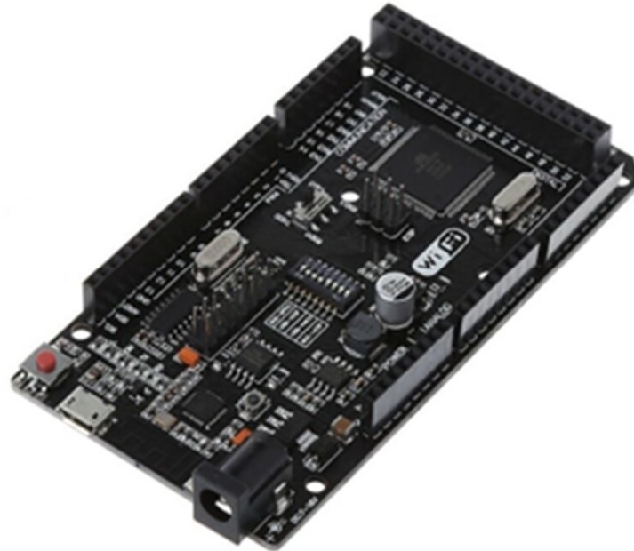
Fig.2 Arduino mega with Wi-Fi module

This medicine distributor utilizes an Arduino Mega R3 board, including an Atmel ATmega2560 microcontroller with a working voltage of 5 volts and input voltage between 7 to 12 volts. This Arduino Mega R3 board comes attached with an ESP8266 Wi-Fi Module, which is used to give Arduino network connectivity.