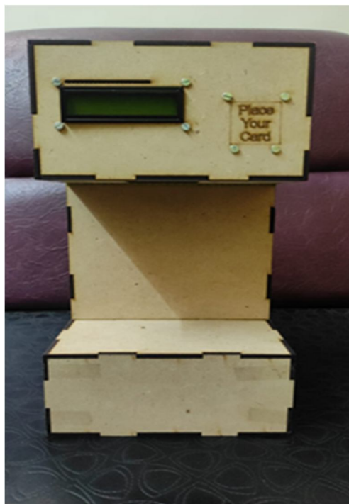
Fig.3 Medicine Dispenser