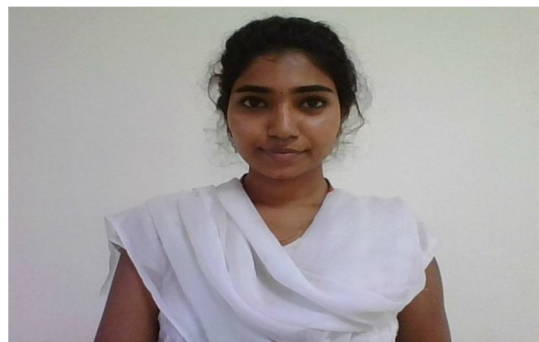
Figure.4.1 Input of the missing person.

The results of the missing person identification is shown below-