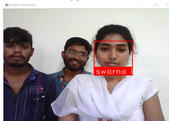
Figure.4.2 Identification of missing person.

The input data is given to the model to detect the Missing person.