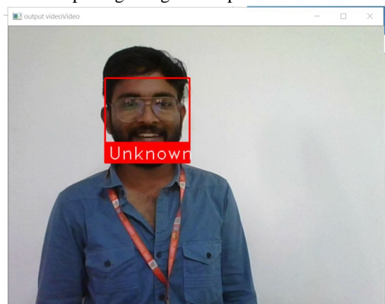
Figure.4.3 Unknown person detected.

The model detected the Missing person b comparing the given input.