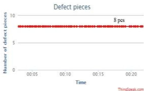
Figure4. Dashboard view for defect pieces

The figure 2 shows the number of garments produced per line at the time interval of 15 min. From the graph in Fig. 3 shown above, efficiency of the line is 73% for the same time interval .Figure 4 shows the number of defective garments per hour.