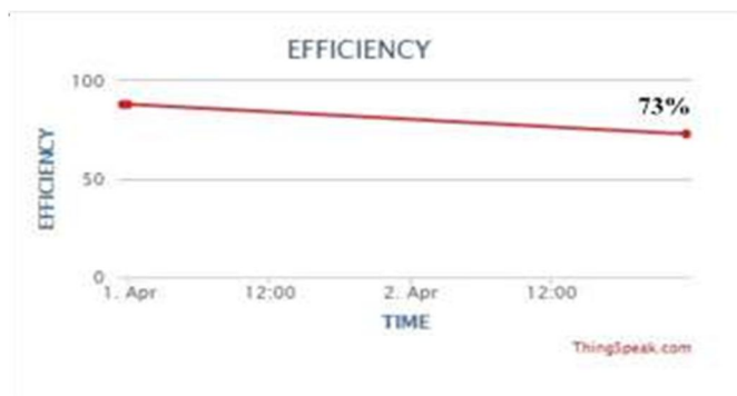
Figure3. Dashboard view for efficiency of line