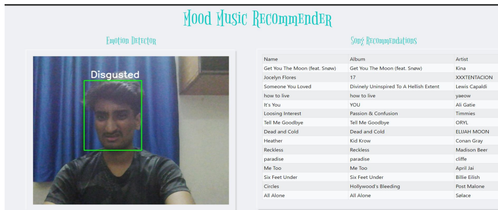
Fig03: Disgusted Emotion Detection And Recommended Music