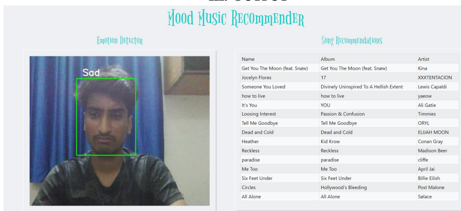
Fig01: Sad Emotion Detection And Recommended Music