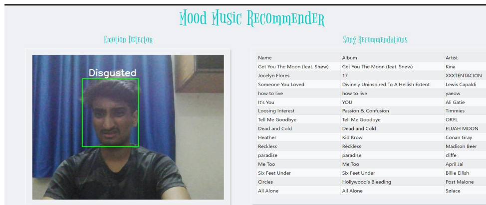
Fig03: Disgusted Emotion Detection And Recommended Music