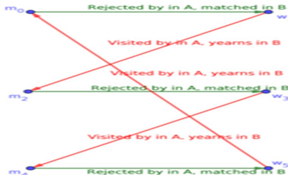
Figure 2.2-2 matching of A and B

2) Extended Gale-Shapely Algorithm: The technique employed by Gale and astronomer to spot a stable match uses a basic delayed acceptance strategy that includes proposals and rejections. Counting on who makes the proposals, the man-oriented algorithm and therefore the girl-oriented algorithm are 2 totally different approaches.