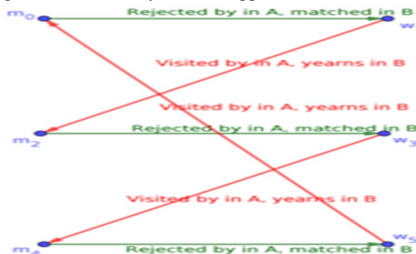
Figure 2.2-2 matching of A and B

2) Extended Gale-Shapely Algorithm: The technique employed by Gale and astronomer to spot a stable match uses a basic delayed acceptance strategy that includes proposals and rejections. Counting on who makes the proposals, the man-oriented algorithm and therefore the girl-oriented algorithm are 2 totally different approaches.