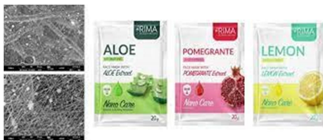
Image No. 5- Nanofiber in Cosmetic