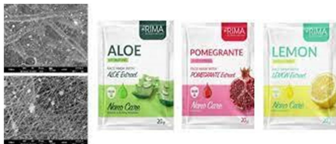
Image No. 5- Nanofiber in Cosmetic