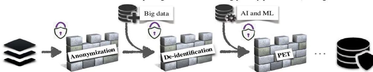
Fig. 2: A overview of the evolution of defence techniques for AI and big data analysis (Dilmaghani et al., 2019).