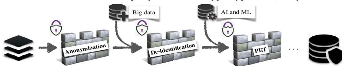
Fig. 2: A overview of the evolution of defence techniques for AI and big data analysis (Dilmaghani et al., 2019).