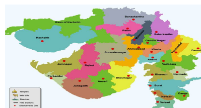
Fig.1 Map of Gujarat State

The study area selected for this study is Padra Taluka of Vadodara district, Gujarat, India. It is located about 16 kilometers from Vadodara city. Padra is located at 22.23°N 73.08°E and it has an average elevation of 79 meters. There are about 83 villages in Padra block.