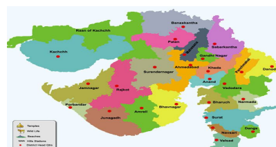
Fig.1 Map of Gujarat State

The study area selected for this study is Padra Taluka of Vadodara district, Gujarat, India. It is located about 16 kilometers from Vadodara city. Padra is located at 22.23°N 73.08°E and it has an average elevation of 79 meters. There are about 83 villages in Padra block.