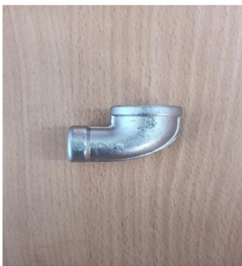
Fig 1. Stainless Steel Elbow Model

We have chosen stainless steel elbow model shown in fig.1 this because of its strength, resistance to corrosion, and capacity to tolerate temperature changes. It is taken into consideration since it guarantees a sturdy and long-lasting structure temperatures, making it easier to get rid of extra particles and impurities