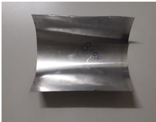
Fig 2. Aluminum sheet

It functions as a reflective liner to direct sunlight onto the trough, utilizing its high reflectivity to efficiently absorb sunlight and generate heat.