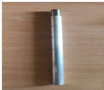
Fig 3. Stainless steel long tube