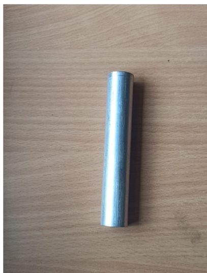
Fig 3. Stainless steel tube

Copper and aluminum are the best materials for receiver tubes (absorber tubes) because they have great thermal conductivity.