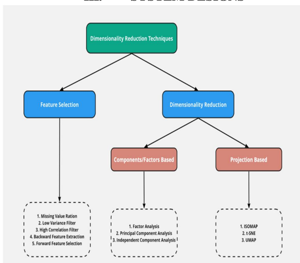
Fig : Network Data Verification Using Machine Learning