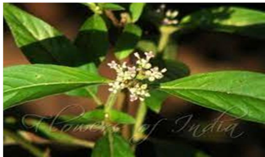
Fig1: Knoxia corymbosa wild

K. corymbosa is a subshrub growing in a wet tropical biome (Figure 1). The species grows to a height of 40-90 cm tall with a little branched stem and narrow lanced shaped leaves with velvety surfaces. The species have exceedingly small purple/ white -colored flowers, found dense at the end of the branches with a flowering season between August – October. World flora online reports 27 synonyms for the K. corymbosa species [21]. K. corymbosa was collected from the tribal locality of Valad in Wayanad, district Kerala. The plant samples were washed, freeze dried, powdered, and kept in moisture free condition.