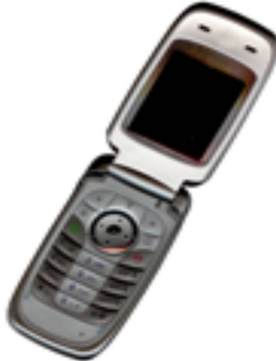
Fig. 2 Example of an unacceptable low-resolution image

Figures must be numbered using Arabic numerals. Figure captions must be in 8 pt Regular font. Captions of a single line (e.g. Fig. 2) must be centered whereas multi-line captions must be justified (e.g. Fig. 1). Captions with figure numbers must be placed after their associated figures, as shown in Fig. 1.