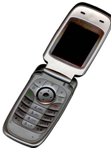
Fig. 3 Example of an image with acceptable resolution