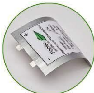
Figure:2. Paper Battery