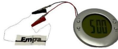
Fig:3. Paper battery by powering the display of an alarm clock.