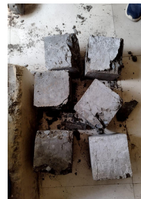
Fig 4.2. Tested specimen