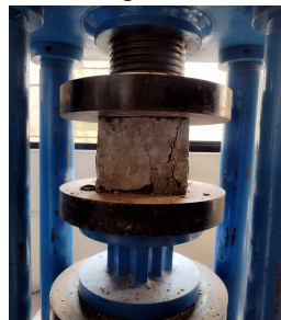
Fig 4.1. Testing of specimen

A = cross-sectional area of the specimen (150 * 150 mm).