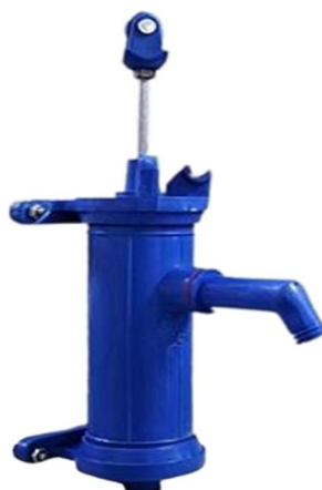
Figure 2: Pump

The pump set and includes a housing in which a foot pedal and drive shaft rotate an eccentric pin rotating with the drive shaft moves a connecting rod which in turn causes push rod to move linearly. The push rod extends into a pressure tight chamber formed above the rising main. A pump rod connected to the push-rod extends to the conventional plunger through verified motion.