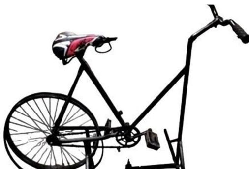
Figure 1: Bicycle Frame