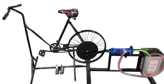
Figure 3: Fabrication Process

This research's manufacturing process took place in Department of Mechanical Engineering at Swami Keshvanand Institute of Engineering Technology, Management & Gramothan, Jaipur. Figure (whatever) depicts the machine in an isometric perspective. The first step of making power operated water pump is the preparation of the stand. Scarp mild steel pipes are made into sufficient pieces and are welded together to get the stand. From the market, the cylinder and piston were carried, and they were mounted on the stand. The stand rod of diameter 4 cm and length 600cm which was machined to 100cm and another two pieces of 65cm on the lathe. A mild steel shaft measuring 30mm (again) and 50mm in length was used to make the connecting rod. The connecting rod was then machined on a grinder to a length of 40cm. A rotating disc was made from 80mmx80mm mildwooden ply sheet and was 40mm in circumference. The suction and delivery pipes are then connected to the suction and delivery ports respectively