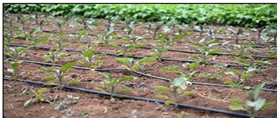
Fig.1 Installation of Drip irrigation in Gangapada Farm

Drip irrigation is more suitable for row crops (vegetables, fruits, sugarcane, and cereal crops except paddy), tree and vine crops are considered because of the high capital costs of installing a drip irrigation system. These systems are also suitable for plantation crop such as coconut, cardamom, cumin, citrus grapes and mango. For orchard crops such as grapes, Banana, pomegranate, etc. is suitable. Vegetable like tomato, chilly, capsicum, cabbage can be grown in drip Drip irrigation system can sustain in many types of soil. On clay soils, irrigation water should be applied slowly to avoid ponding and runoff. On sandy soils, higher emitter discharge will be appropriate to ensure lateral movement of the water into the soil. It can be applied to irrigate crops grown on undulating land topography and slopes where the depth of soil is limited. Drip systems in sandy soils must be carefully designed and installed to achieve good results. The soil area wetted by the dripper (known as the water 'bulb') varies according to soil type. In porous sands with low water retention, the bulb is long and narrow (often < 30 cm diameter). Drippers may therefore need to be spaced more closely in sands (for example every 20 to 30 cm) compared to clay soils, where the bulb diameter is much wider (often >75 cm).