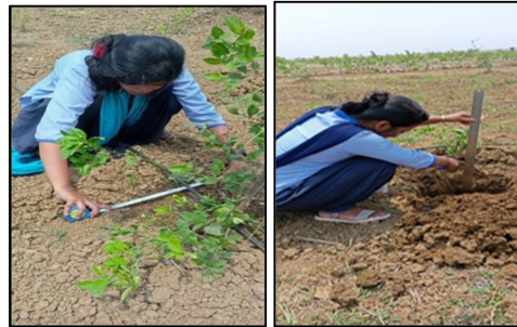
Fig 5. Measurement of wetting pattern

An emitter of 8 lph was set to feed water to the plant. Then the water was for 1 hour to flow. Exactly after, 1hr the wetting diameter of the beds was measured with a tape. After those beds were left for 24 hours. Next, the vertical wetting section of three beds was cut with a spade and by a measuring taped the reading was taken.