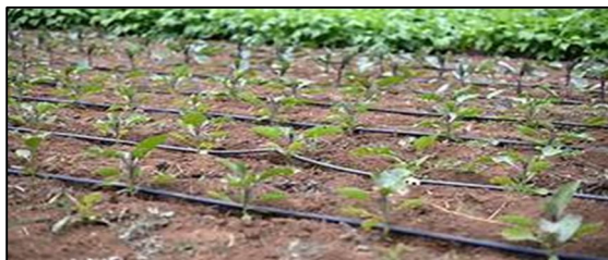
Fig.1 Installation of Drip irrigation in Gangapada Farm

Drip irrigation is more suitable for row crops (vegetables, fruits, sugarcane, and cereal crops except paddy), tree and vine crops are considered because of the high capital costs of installing a drip irrigation system. These systems are also suitable for plantation crop such as coconut, cardamom, cumin, citrus grapes and mango. For orchard crops such as grapes, Banana, pomegranate, etc. is suitable. Vegetable like tomato, chilly, capsicum, cabbage can be grown in drip Drip irrigation system can sustain in many types of soil. On clay soils, irrigation water should be applied slowly to avoid ponding and runoff. On sandy soils, higher emitter discharge will be appropriate to ensure lateral movement of the water into the soil. It can be applied to irrigate crops grown on undulating land topography and slopes where the depth of soil is limited. Drip systems in sandy soils must be carefully designed and installed to achieve good results. The soil area wetted by the dripper (known as the water 'bulb') varies according to soil type. In porous sands with low water retention, the bulb is long and narrow (often < 30 cm diameter). Drippers may therefore need to be spaced more closely in sands (for example every 20 to 30 cm) compared to clay soils, where the bulb diameter is much wider (often >75 cm).