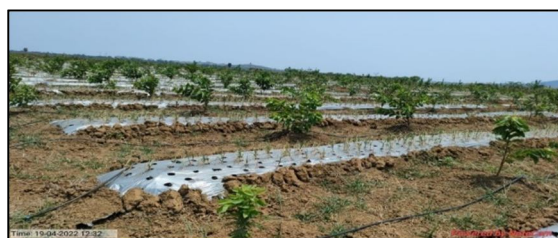
Fig.2 Study area at Gangapada farm

This experiment was conducted on drip irrigation in a farm, near Coconut Development Board, Gangapada, Bhubaneswar, Odisha. The total area is about 25 acres. Papaya, Drum stick and lemon, etc. are grown there. Garlics are grown there using intercropping. About 700 Guava plants are planted.