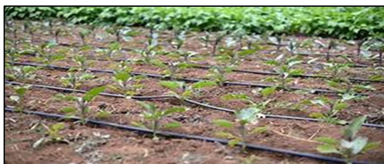
Fig.1 Installation of Drip irrigation in Gangapada Farm

Drip irrigation is more suitable for row crops (vegetables, fruits, sugarcane, and cereal crops except paddy), tree and vine crops are considered because of the high capital costs of installing a drip irrigation system. These systems are also suitable for plantation crop such as coconut, cardamom, cumin, citrus grapes and mango. For orchard crops such as grapes, Banana, pomegranate, etc. is suitable. Vegetable like tomato, chilly, capsicum, cabbage can be grown in drip Drip irrigation system can sustain in many types of soil. On clay soils, irrigation water should be applied slowly to avoid ponding and runoff. On sandy soils, higher emitter discharge will be appropriate to ensure lateral movement of the water into the soil. It can be applied to irrigate crops grown on undulating land topography and slopes where the depth of soil is limited. Drip systems in sandy soils must be carefully designed and installed to achieve good results. The soil area wetted by the dripper (known as the water 'bulb') varies according to soil type. In porous sands with low water retention, the bulb is long and narrow (often < 30 cm diameter). Drippers may therefore need to be spaced more closely in sands (for example every 20 to 30 cm) compared to clay soils, where the bulb diameter is much wider (often >75 cm).