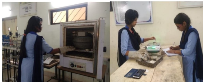
Fig 5. Measurement of moisture content

Then the amount of water was presented there was calculated. Next, the weight of empty tin measured and from that the weight of dry soils were calculated. Lastly, the moisture available there was measured.