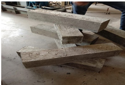
Fig. Casted beam