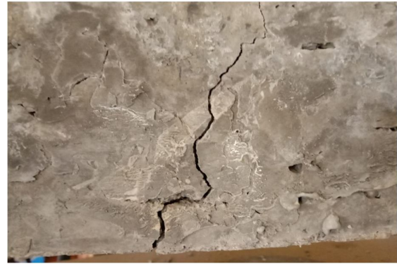
Fig. failure of beam