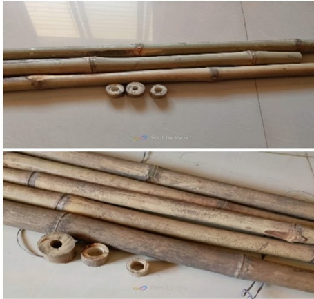
Fig. Manga Bamboo