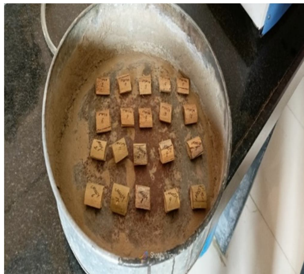
Fig. specimen for Moisture Content