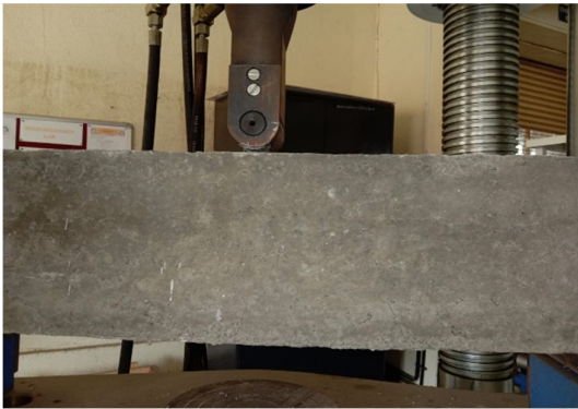
Fig. 3-point loading in beam

Minimum strength required is 3.13 \text{ N/mm}^2 which is easily achieved in all messy specimens tested above.