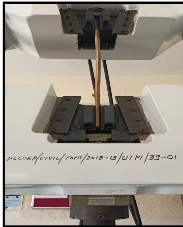
Fig. Tensile test specimen