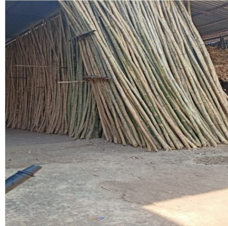
Fig. Messy Bamboo