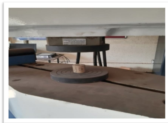
Fig. Compression test specimen