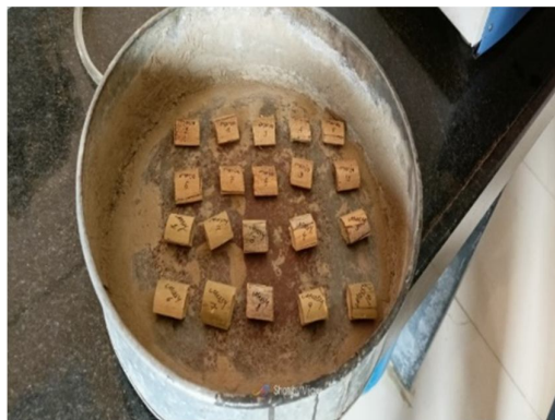
Fig. specimen for Density test