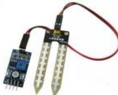
Fig. 5 Soil Moisture Sensor

Soil moisture sensor is the device which measures the content of water in the soil. Soil moisture measurement is important to help farmers manage their irrigation systems. It consists of two probes which are used to measure the volumetric content of water. The two probes allow the current to pass International Journal of Pure and Applied Mathematics.