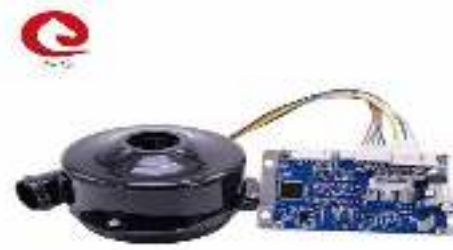
Fig. 9 Motor Driver L293D

A DC pump is a motor-driven device that moves liquids using direct current (DC) power, typically from batteries or solar panels. It operates efficiently at low voltages (such as 6V, 12V, or 24V) and is commonly used in water circulation, irrigation, and cooling systems. DC pumps are compact, energy-efficient, and suitable for portable or automated applications like aquariums, fountains, and automotive cooling