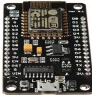
Fig. 3 Node MCU ESP8266 IC

Node MCU ESP8266 is a low-cost, Wi-Fi-enabled microcontroller used for IoT and automation projects. It is built around the ESP8266 chip, which allows devices to connect to the internet and communicate wirelessly. It features built-in Wi-Fi, GPIO pins for sensor and actuator connections, and supports programming with Arduino IDE or Lua. The module operates on 3.3V and is widely used in smart home systems, wireless data logging, and remote monitoring applications.