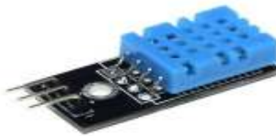
Fig. 4 Temperature Sensor

A temperature sensor is a device that provides the temperature measurement at a given time. It is a resistance temperature detector which detects the temperature changes. It provides high quality and quick acknowledgement. Being a mixed sensor it provides with the values both of temperature and humidity. The sensor calibrates digital signal output. Using this sensor gives greater stability and higher reliability. The sensor used is DHT11 Module temperature and humidity sensor module. The DHT11 is a basic, ultra-low-cost digital temperature and humidity sensor. It uses a capacitive humidity sensor and a thermistor to measure the surrounding air, and spits out a digital signal on the data pin.