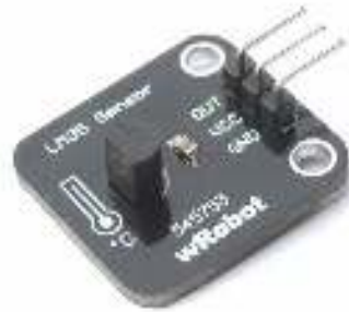
Fig. 6 LM35 Temperature Sensor

The LM35 temperature sensor is a precision device that provides an analog voltage output proportional to temperature in Celsius. It operates from -55^{\circ}\text{C} to 150^{\circ}\text{C} with high accuracy and does not require calibration. The sensor outputs 10mV per degree Celsius, making it easy to interface with microcontrollers like Arduino and Raspberry Pi. It is widely used in weather monitoring, industrial automation, medical devices, and home automation due to its reliability and low power consumption.