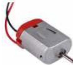
Fig. 10 DC Motor

A DC motor is an electric motor that converts direct current (DC) into mechanical motion. It works based on electromagnetic principles, where current passing through a coil generates a magnetic field that interacts with permanent magnets, causing rotation. The speed and direction of a DC motor can be controlled by varying the voltage or using an H-bridge circuit. DC motors are widely used in robotics, automation, electric vehicles, and household appliances due to their efficiency and ease of control.