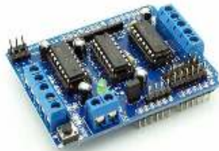
Fig. 8 Motor Driver L293D

The L293D motor driver is an integrated circuit used to control the direction and speed of DC motors. It allows microcontrollers to drive two motors independently using H-bridge circuits. The chip operates on 5V logic and can handle motor voltages up to 36V with a current of 600mA per channel. It is commonly used in robotics, automation, and motor control applications.