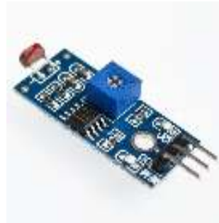
Fig. 11 LDR Chip

The polyhouse monitoring and controlling system uses a Light Dependent Resistor (LDR) sensor to measure and monitor light intensity levels. The LDR sensor detects changes in light intensity and helps to maintain optimal lighting conditions for plant growth