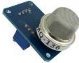
Fig. 12 Gas Sensor

The polyhouse monitoring and controlling system utilizes a gas sensor to detect and monitor the levels of carbon dioxide (CO 2 ). This sensor helps to maintain optimal CO 2 levels, ensuring healthy plant growth and maximizing crop yields.