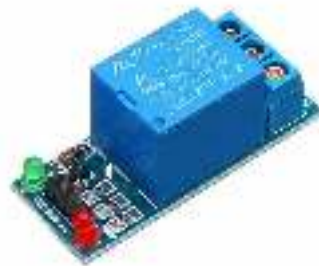
Fig. 7 Relay Module

A relay module is an electronic switch that allows low-voltage microcontrollers to control high-voltage devices. It uses an electromagnetic coil to open or close circuits and can operate AC or DC loads like lights and motors. Relay modules are widely used in automation, IoT, and industrial applications.