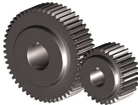
Figure 2 Spur Gears