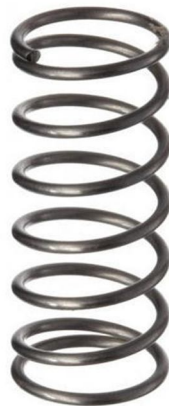
Figure 3 Compression Spring