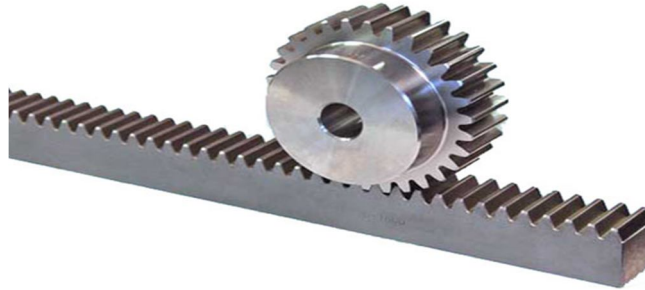
Figure 1 Rack and Pinion