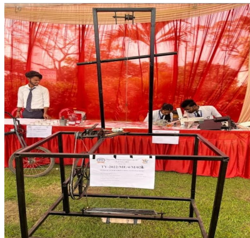
Fig 02. Final Project