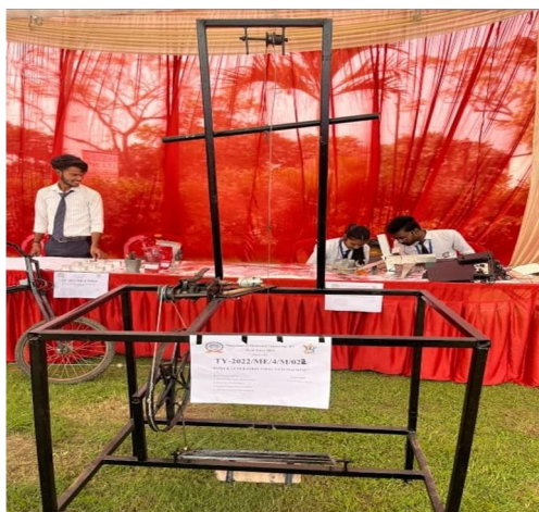
Fig 02. Final Project