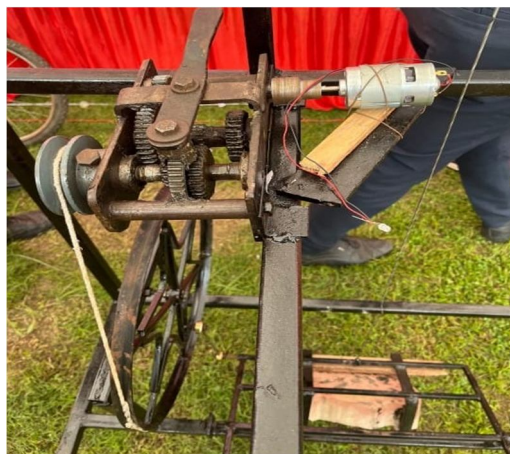
Fig 03. Gear Arrangement