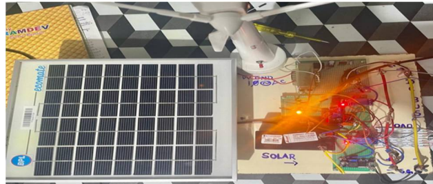
Fig.2 Hardware setup

and to DC bus through relay. Through voltage divider voltage is sensed in each line separately . ACS712 current sensor senses the current in each line, We have LED strips connected as load to DC bus. Voltage divider output of wind section is connected to A1 pin of Arduino . Voltage divider output of solar section is connected to A0 pin of Arduino . Current sensor output is connected to A3 pin of Arduino. D5 pin of Arduino is given to wind section line relay. D6 pin of Arduino is given to Solar section line relay. D8 pin of Arduino is given to GREEN LED 1. D9 pin of Arduino is given to GREEN LED 2. D10 pin of Arduino is given to RED LED. D11 pin of Arduino is given to YELLOW LED.