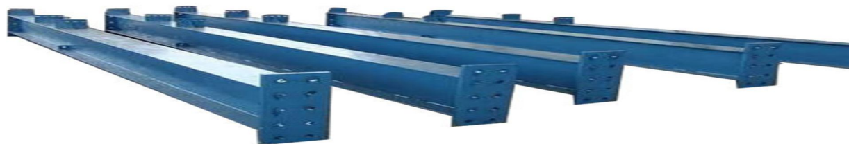
Fig:- Columns Used in PEB

The main purpose of the column is to transfer the vertical loads to the foundation. However apart of the horizontal actions (wind action) is also transferred through the column. Basically in pre-engineered building column are made up of I-section which are most economical than others. The width and breadth will, go on increasing from bottom to top of the column I section consists of flanges and web which are made from plates by welding.