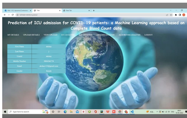
Fig. 2: Details of the Patient